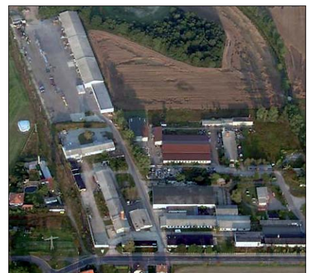
Tyco Electronics Raychem GmbH, Falkenberg site