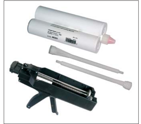
GURONIC C400-0 twin cartridge

TE Connectivity, a first choice partner when it comes to developing new materials and offering services tailored to your needs. You have not found the right material in our assortment? We also offer customized resin formulation and development services. Whatever your project may entail, we will provide the expert consulting you need to make it a success.