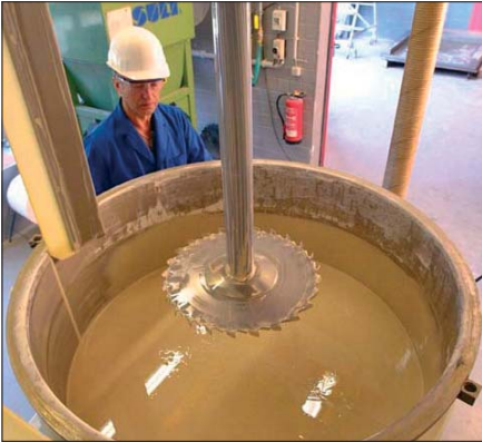
Potting resin production

TE Connectivity, a first choice partner when it comes to developing new materials and offering services tailored to your needs. You have not found the right material in our assortment? We also offer customized resin formulation and development services. Whatever your project may entail, we will provide the expert consulting you need to make it a success.