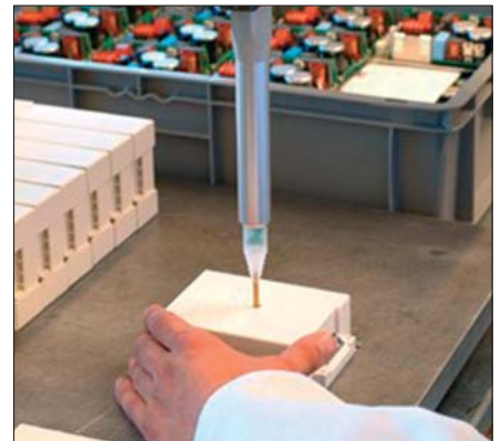
GURONIC customized potting