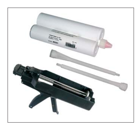
GURONIC C400-0 twin cartridge

TE Connectivity, a first choice partner when it comes to developing new materials and offering services tailored to your needs. You have not found the right material in our assortment? We also offer customized resin formulation and development services. Whatever your project may entail, we will provide the expert consulting you need to make it a success.