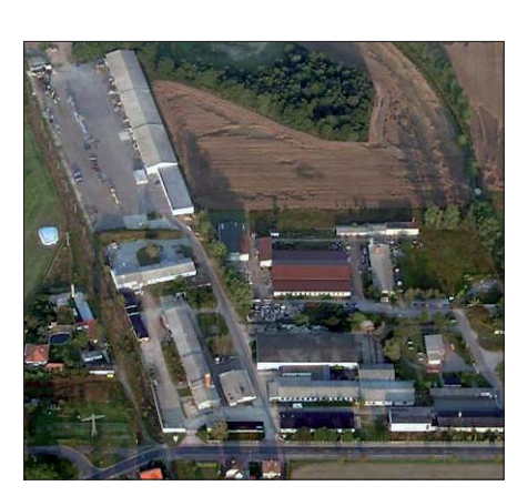
Tyco Electronics Raychem GmbH, Falkenberg site