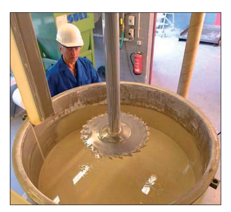
Potting resin production

TE Connectivity, a first choice partner when it comes to developing new materials and offering services tailored to your needs. You have not found the right material in our assortment? We also offer customized resin formulation and development services. Whatever your project may entail, we will provide the expert consulting you need to make it a success.